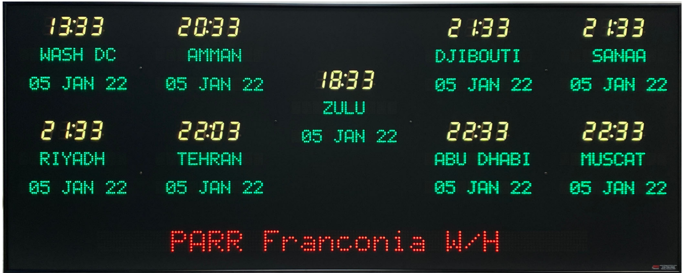
Model 7329A - 1.8" time, 1.2" zone labels & character date, 9 zone with a 48" color moving message display