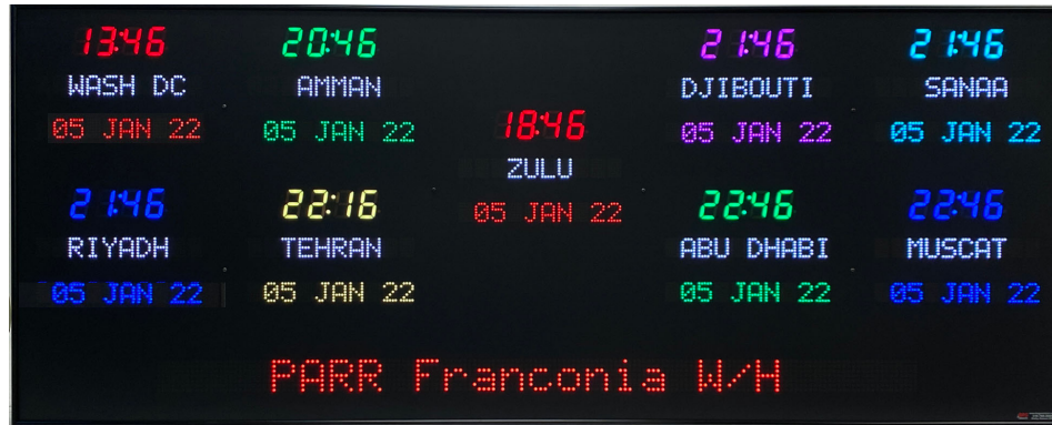
Model 7329A - 1.8" time, 1.2" zone labels & character date, 9 zone with a 48" color moving message display

The 7329 series time zone clocks have user changeable multi-color bar-segment LED time displays with a ten character user changeable multi-color dot matrix digital zone labels & dates below & a 7 color moving message display. The moving message display is either 2.0" or 4.0" single line display. The 7329 models display 9 time zones.